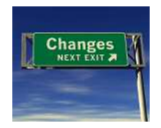
Behavior Change Programs